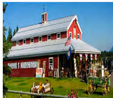
THE BARN ANTIQUES