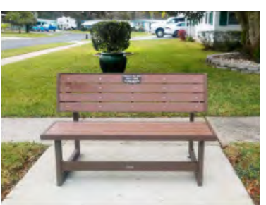
Her smile will always be remembered is inscribed on the new bench purchased in