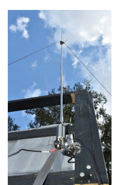
One of three antennas in use.