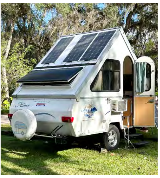
Solar panels on camper provide off-grid