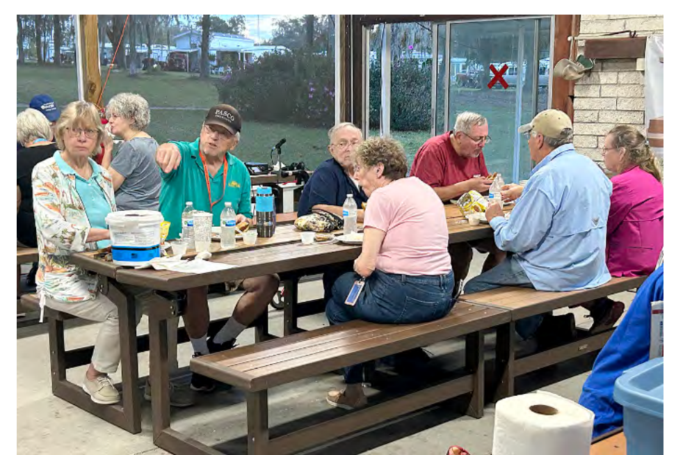
After a hard day of communicating, it's time for a hearty meal.